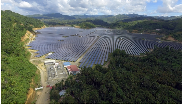
This is an aerial view of the 73-hectare First Toledo Solar Energy Corp.'s solar power plant in Barangay Talavera, Toledo City.